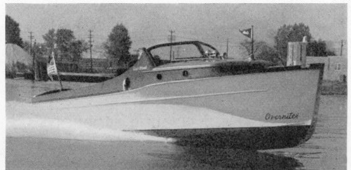
24'6" GAR WOOD OVERNITER